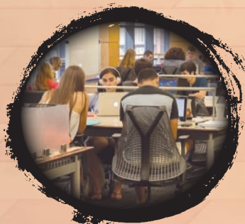
Library West Seating: 1,573 Visitors: 880,482