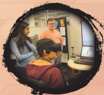
Marston Science Library Seating: 2,105 Visitors: 1,584,992