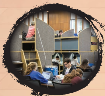
Architecture & Fine Arts Library Seating: 124 Visitors: 45,806