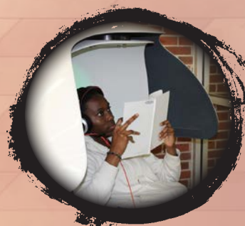
Health Science Center Libraries (Gainesville) Seating: 869 Visitors: 350,063