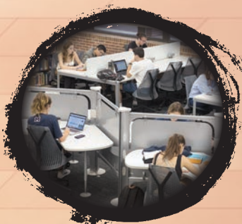
Education Library Seating: 604 Visitors: 118,563