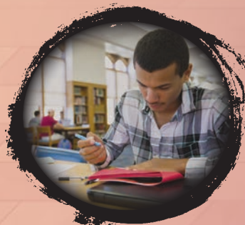
Smathers Library (includes the Grand Reading Room, Panama Canal Gallery, Map & Imagery Library, Judaica Suite, and the Latin American & Caribbean Collection) Seating: 231 Visitors: 205,418